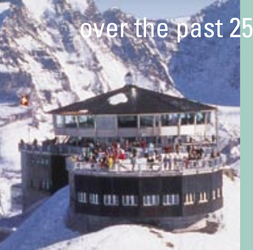
Piz Gloria ski lodge on Schilthorn mountain in the Swiss Alps

that the vast majority of them installed